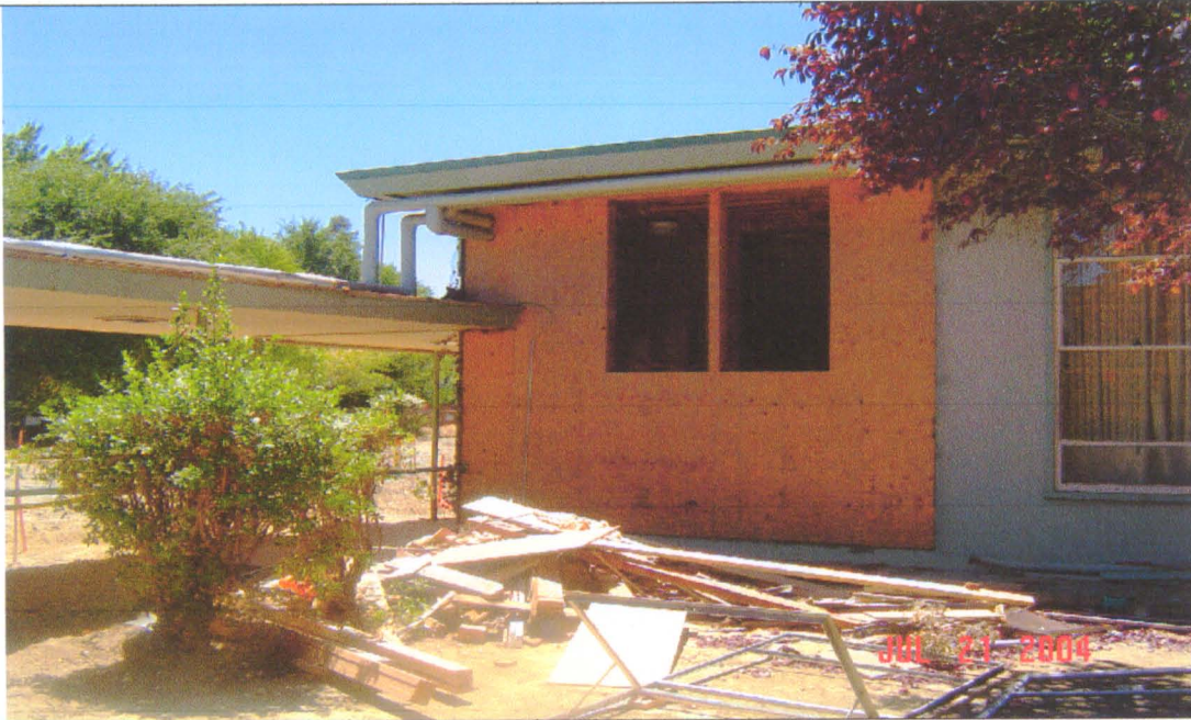
The wall of this bathroom was reframed due to dry rot. Here is a picture of the newly reframed wall.