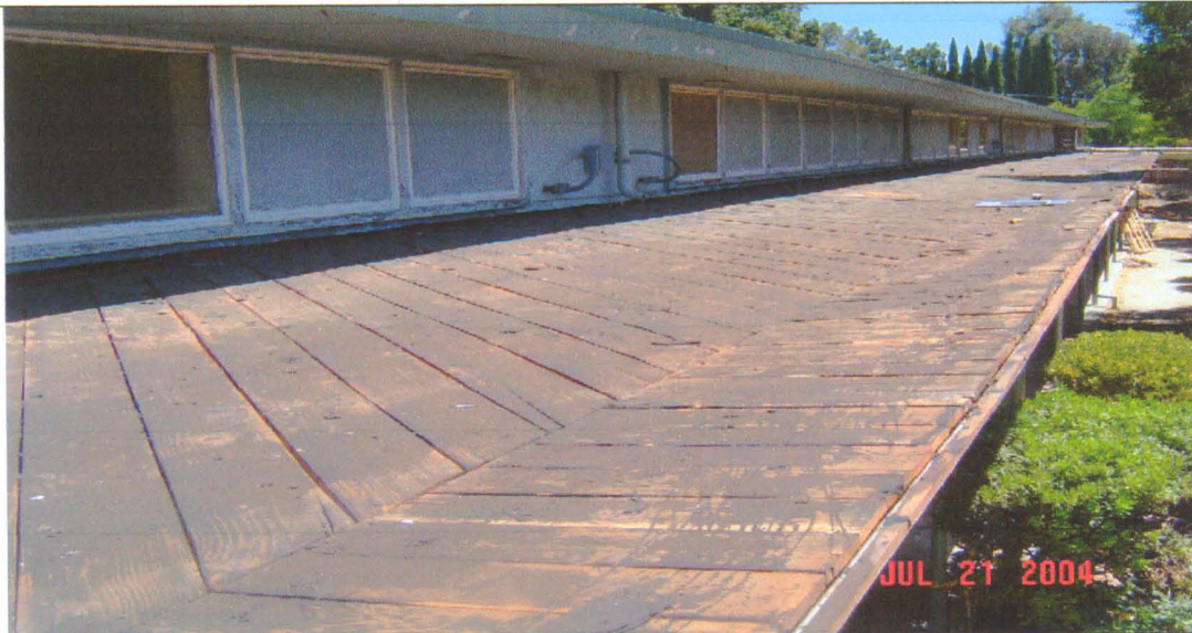
The canopies are being re-roofed. Here is a picture of the canopy roof after the old roofing has been removed, and is being prepared for the new.