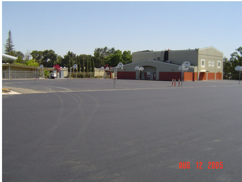
New paving at play area