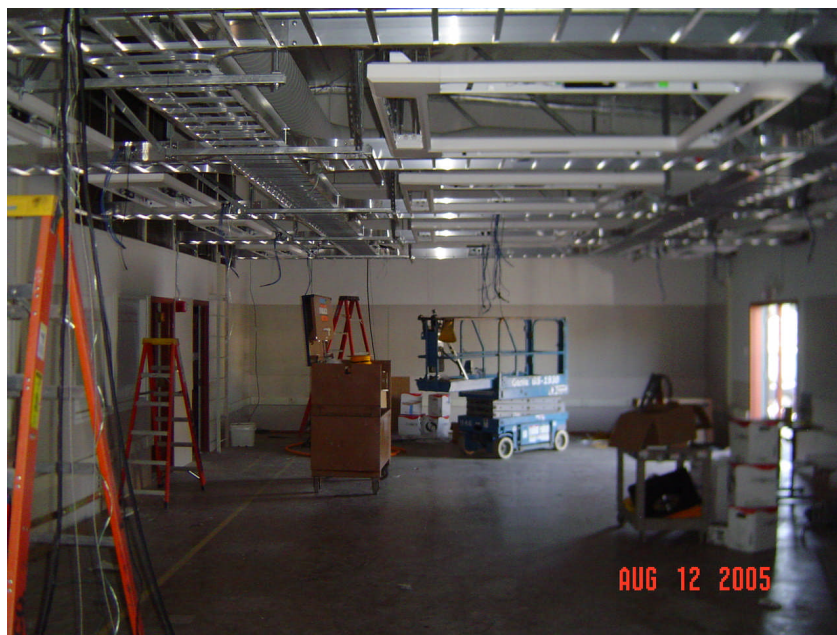
Unistrut cable trays in Tech Center