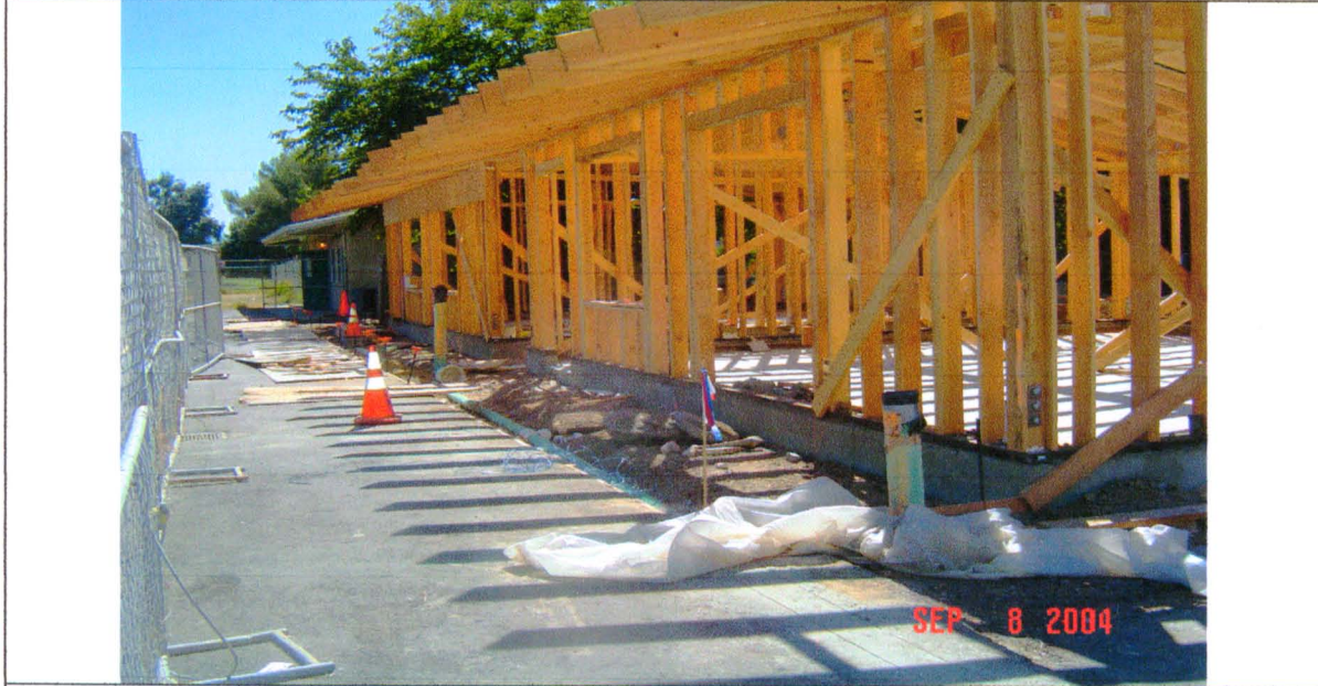
New Classroom Framing