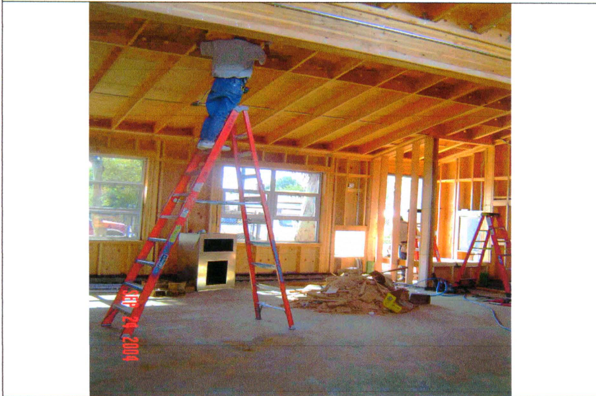
New Classroom Interior