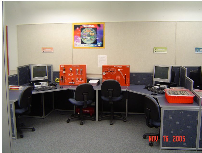
Tech Center Work Station