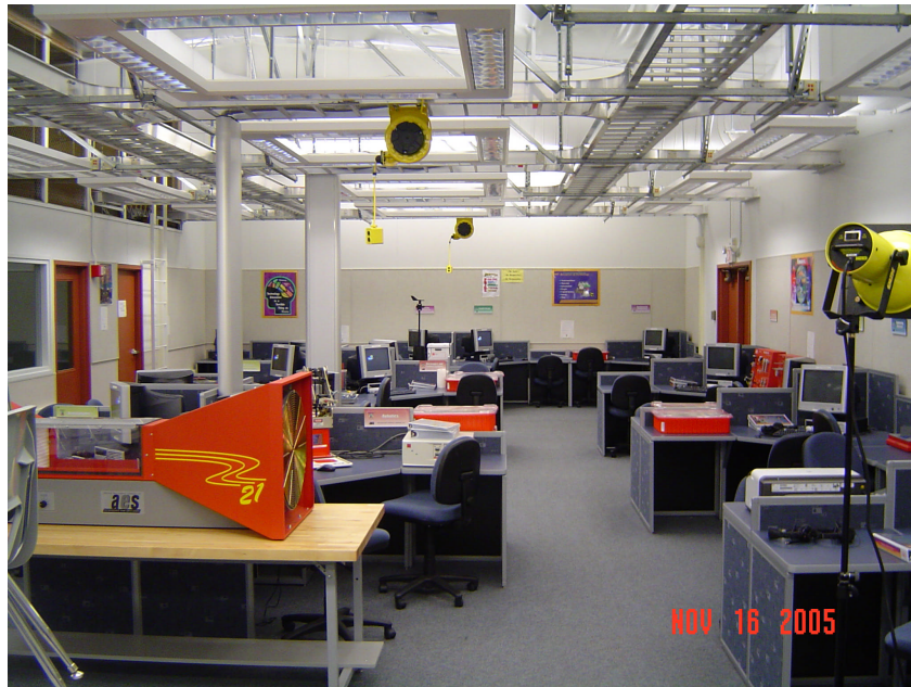
Completed Tech Center